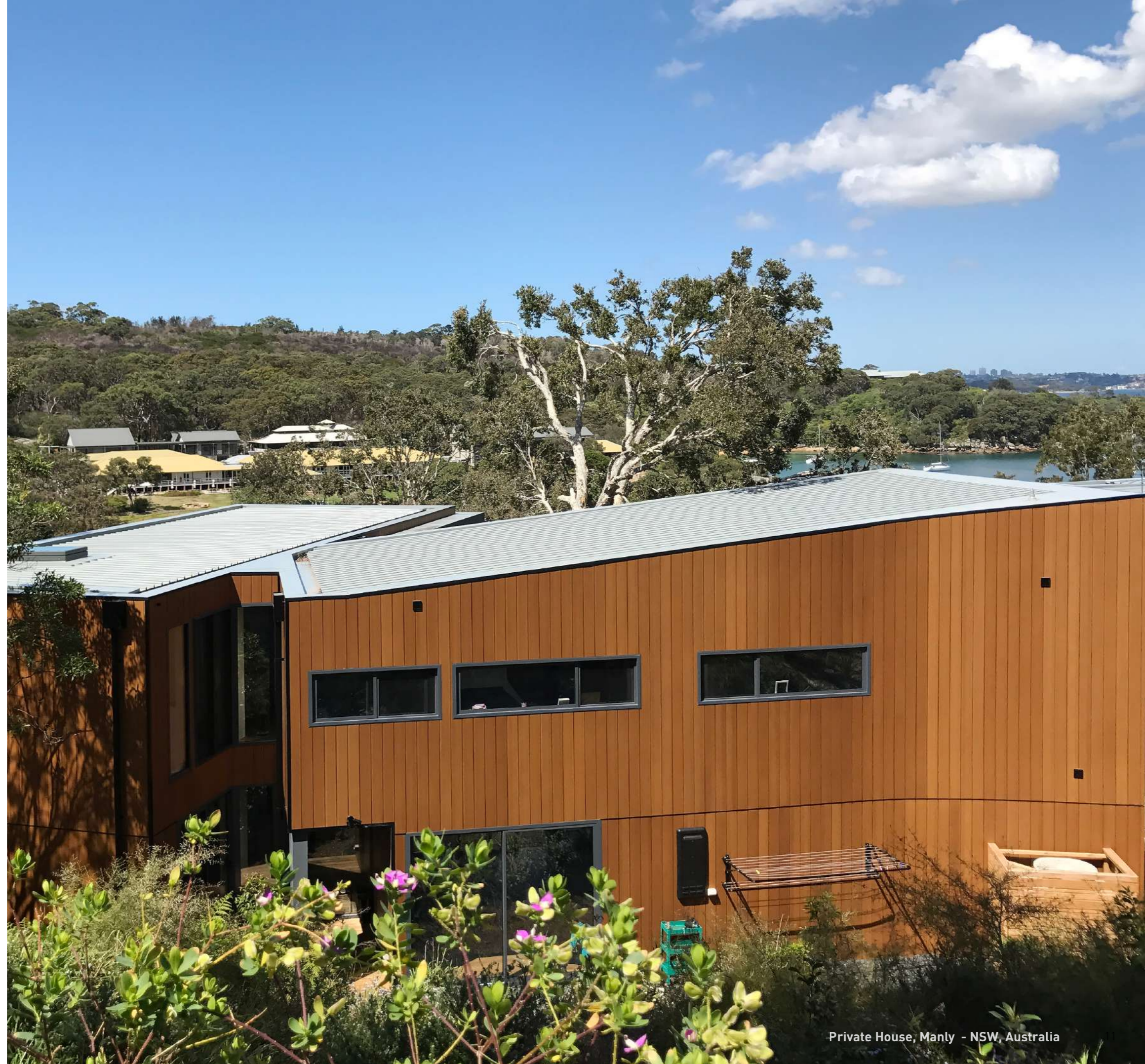
Private House, Manly - NSW, Australia

Lightweight & Durable Fire & Water resistant Natural Timber Look & Feel Adds Warmth and Style Enhances Aesthetic Appeal Variety of Colours & Finishes Fungus, Termite & Mould Resistant Environmentally Friendly product Acoustic & Thermal Insulation Can be Orientated Vertically or Horizontally Quick and Easy to Install